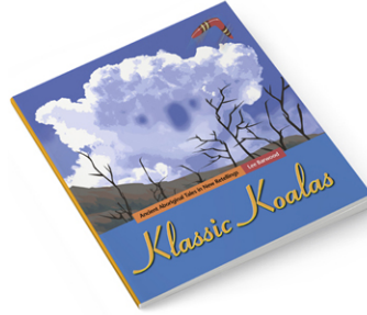
Klassic Koalas: Ancient Aboriginal Tales in New Retellings