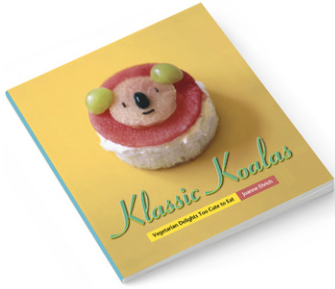
Klassic Koalas: Vegetarian Delights Too Cute to Eat