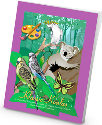
Klassic Koalas: A Coloring Book of more than 80 Koalas and Uniquely Australian Creatures