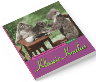
Klassic Koalas: Vintage Postcards and Timeless Quotes of Wisdom