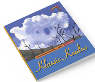
Klassic Koalas: Ancient Aboriginal Tales in New Retellings