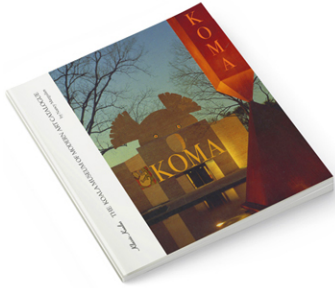
Klassic Koalas: The Koala Museum of Modern Art Catalogue