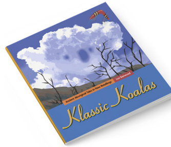
Klassic Koalas: Ancient Aboriginal Tales in New Retellings