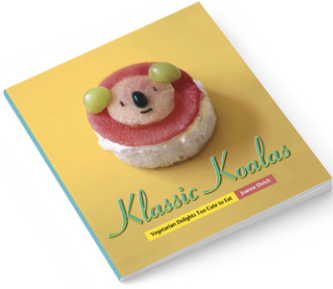
Klassic Koalas: Vegetarian Delights Too Cute to Eat