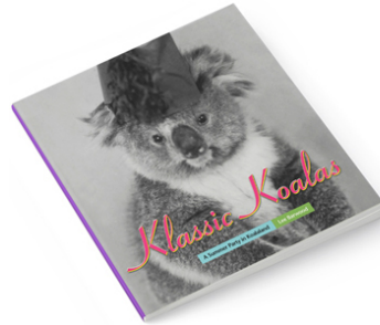
Klassic Koalas: A Summer Party in Koalaland