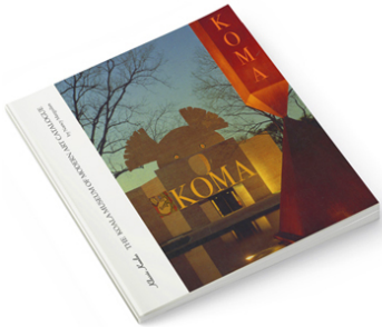
Klassic Koalas: The Koala Museum of Modern Art Catalogue