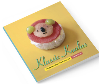
Klassic Koalas: Vegetarian Delights Too Cute to Eat