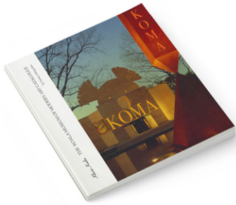
Klassic Koalas: The Koala Museum of Modern Art Catalogue