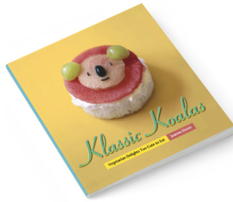
Klassic Koalas: Vegetarian Delights Too Cute to Eat