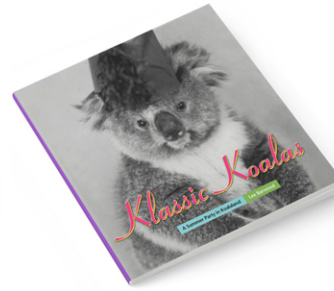
Klassic Koalas: A Summer Party in Koalaland