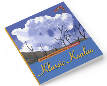
Klassic Koalas: Ancient Aboriginal Tales in New Retellings